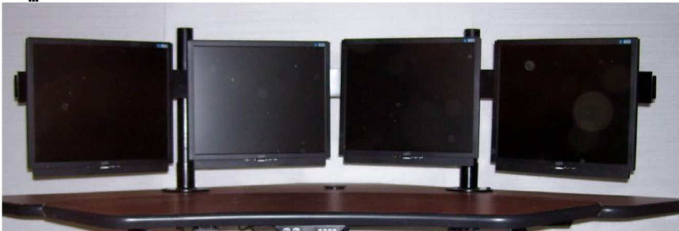
FOCAL-LINK IS A SYSTEM OF POLE MOUNTED ARC SHAPED FLAT PANEL MOUNTING STRUCTURES AND A MULTI-LINK FOLDING SUPPORT THAT PROVIDES AN ADJUSTABLE FOCAL LENGTH.